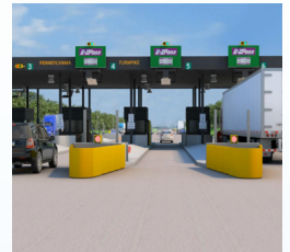
Beaver Valley Expressway

Proceed through the tolling facility at posted speed.